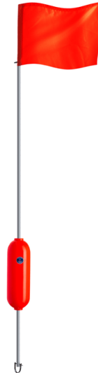
Pot Marker (0431)