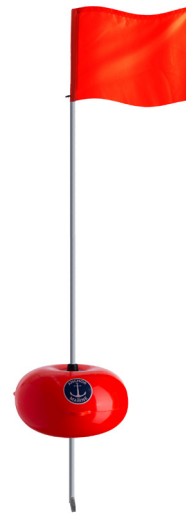
Niftie Marker (0490)